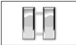
O-3 CAPTAIN (Capt)