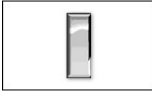
O-2 FIRST LIEUTENANT (1Lt) (SILVER)