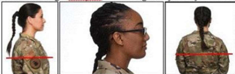
Braided Ponytails/Multiple Braids in a Single Ponytail