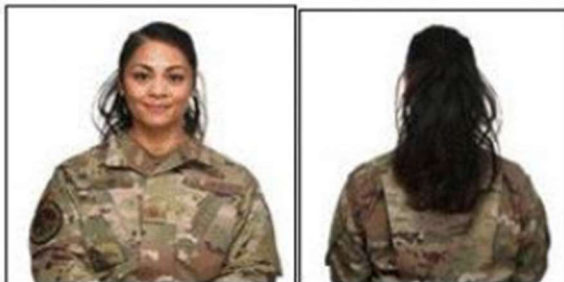
Pulled back secured and does not exceed 6 inch radius