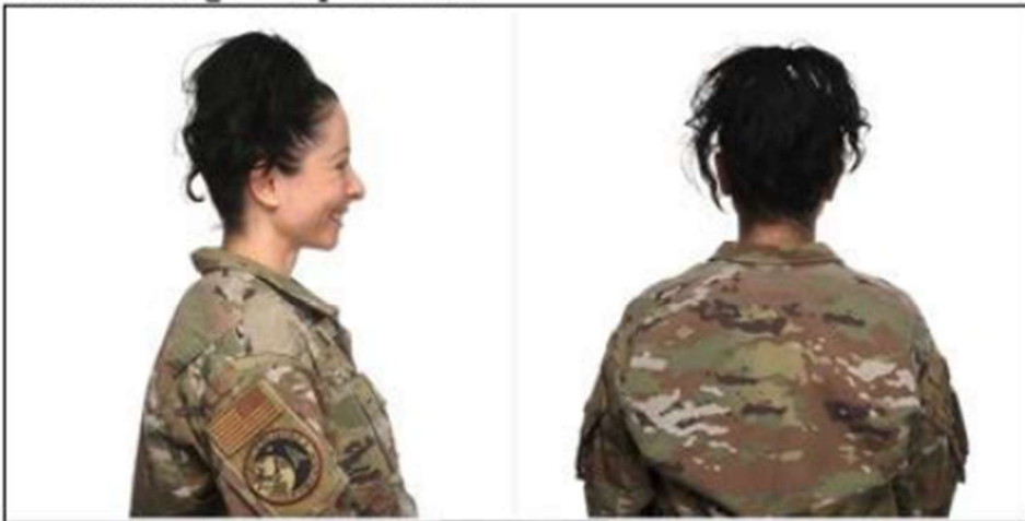
Ponytail Fasten on the Crown of Head.