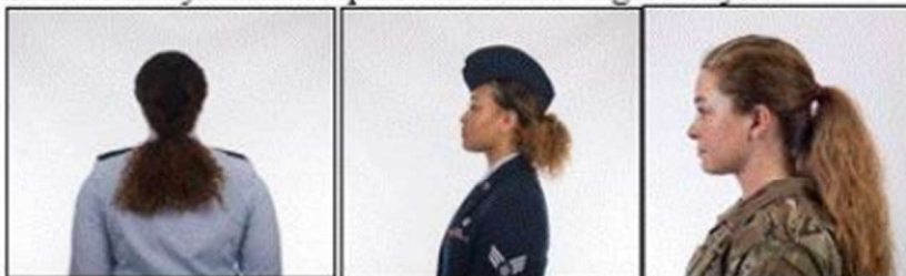
Pulled back secured and does not exceed 6 inch radius