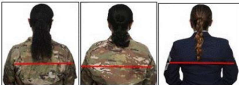
Unbraided Single Ponytail/Pull-through Ponytail Style/Braided Ponytail