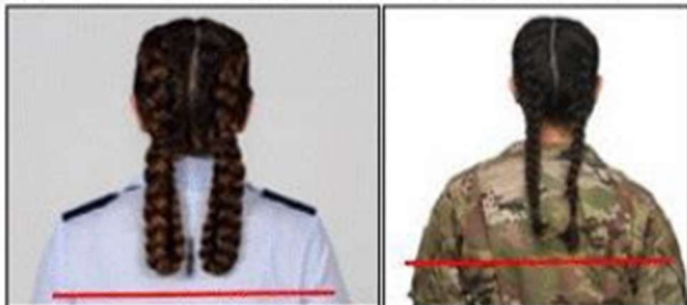
Two Braids Looped Underneath/Two Braids