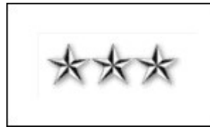
O-9 LIEUTENANT GENERAL (Lt Gen)