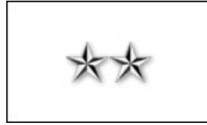
O-8 MAJOR GENERAL (Maj Gen)