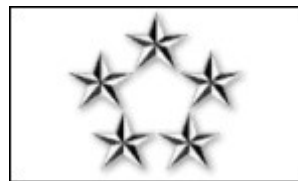
GENERAL OF THE AIR FORCE (Gen AF) * Only used during wartime