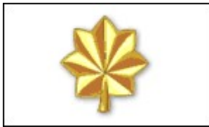
O-4 MAJOR (Maj) (GOLD)