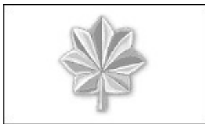
O-5 LIEUTENANT COLONEL (Lt Col) (SILVER)