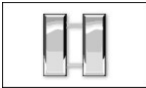
O-3 CAPTAIN (Capt)