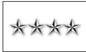
O-10 GENERAL (Gen)