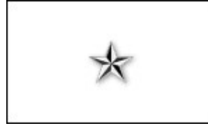
O-7 BRIGADIER GENERAL (Brig Gen)